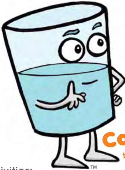
Cappie the cup™